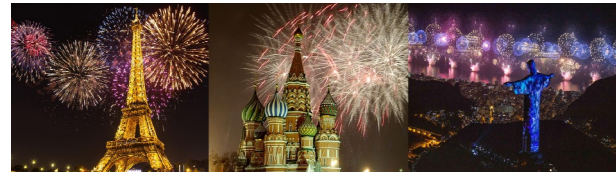
Countries visited by AGG NMSU students since 2009

Happy New Year, Aggies from near and far!